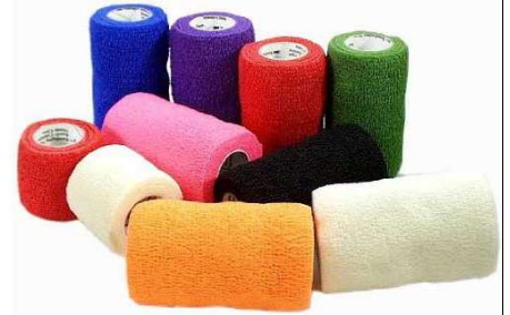
2 Flexible Stretch Cohesive Bandages