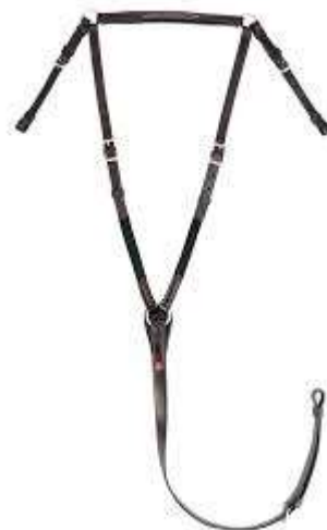
Polocrosse: Extra Breastplate