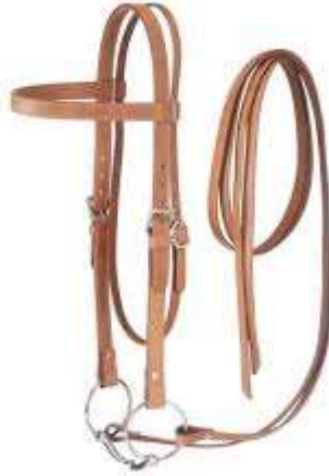
Western: Extra Headstall w/Bit & Reins to fit all mounts