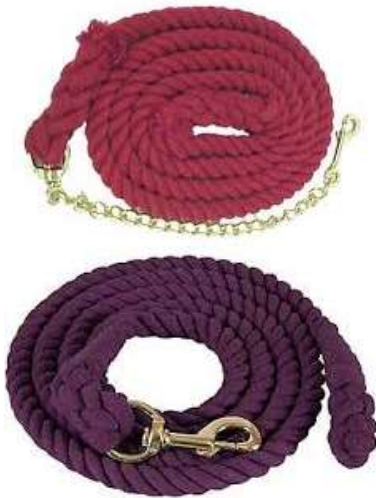
Extra Lead Ropes with & without chain