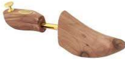
Boot Trees (Toe)