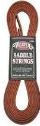
Western: Extra Latigo Laces/Ties Strings (8+)