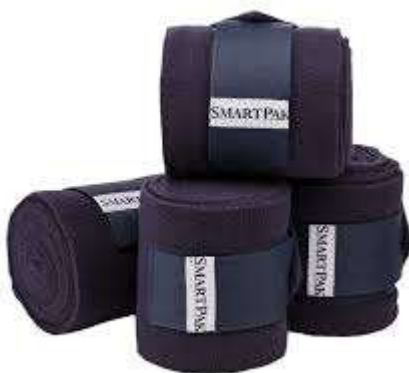
Polocrosse: 2 Extra Pairs of Boots/Bandages