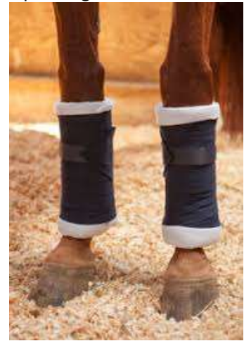
Set of 4 Stable Wraps w/suitable padding to fit all mounts