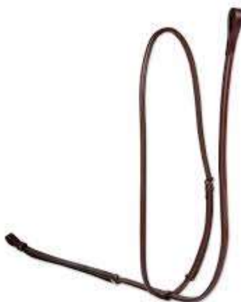
Polocrosse: Extra Standing Martingale