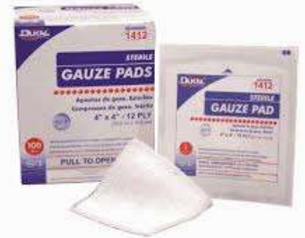
4"x4" Sterile Wound Dressing Gauze Pads (8+)