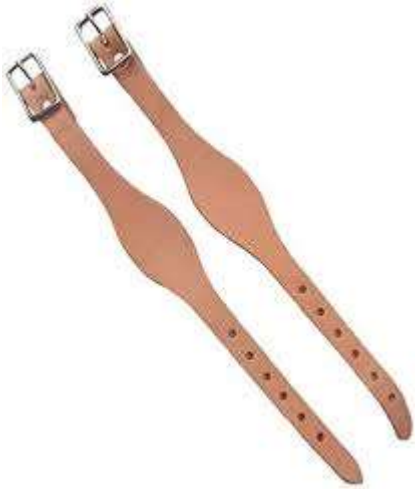
Western: Extra Stirrup Hobbles