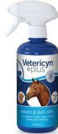
Topical Antibacterial, Antimicrobial, or Antibiotic Agent (2oz+ exp date)