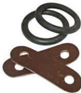
Extra Rubber Bands w/Tabs for Peacock Stirrups