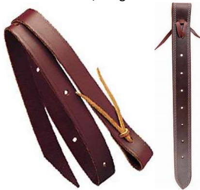
Western: Extra Latigo and Off-Side Billet w/Latigo Tie