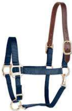
Extra Break-Away Halter to fit all mounts