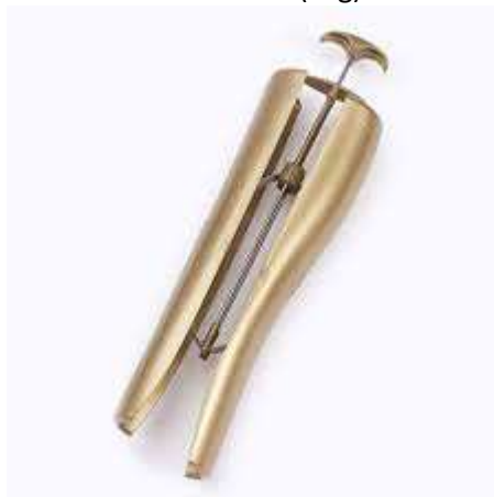
Boot Trees (Leg)