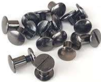
Western: Extra Chicago Screws (10+)