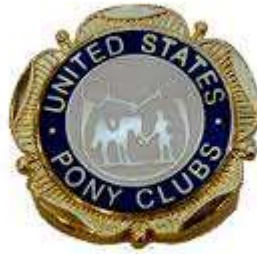
2 Pony Club Pins