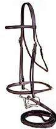
Extra English Bridle w/Bit & Reins to fit all mounts