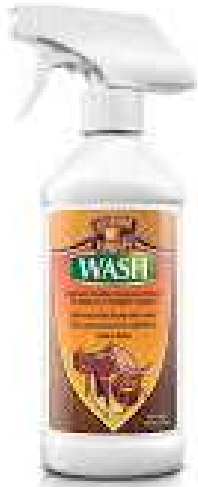
Cleaner appropriate for tack