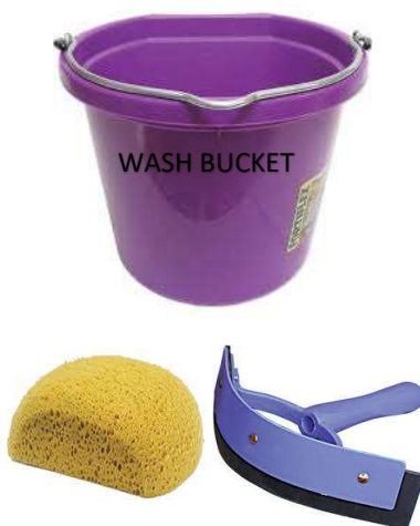
Polocrosse: Extra 5-Gallon Wash Bucket, Scraper, & Sponge per horse