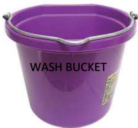
Eventing: Extra 5-Gallon Wash Bucket