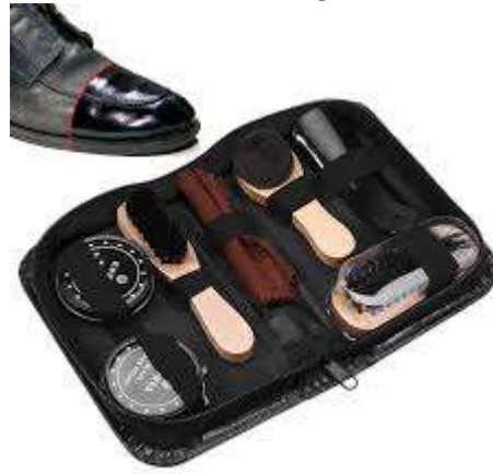
Boot Polishing Kit