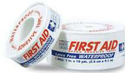
Adhesive Tape Roll (1" min width)