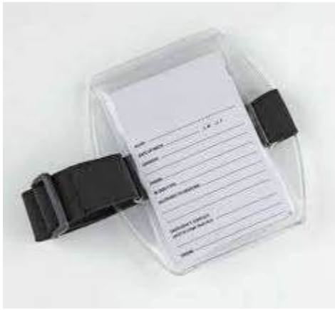
Medical Armband w/Blank Card