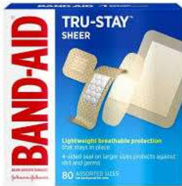
Band-Aids (12+ of assorted sizes)