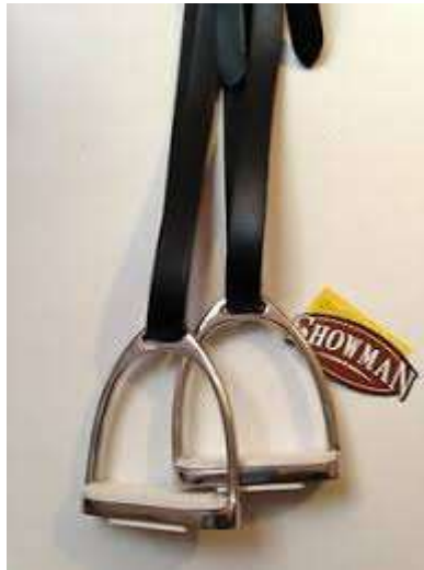
Extra Pair of English Stirrup Leathers w/Irons