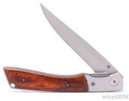
Jackknife (hung by entrance)